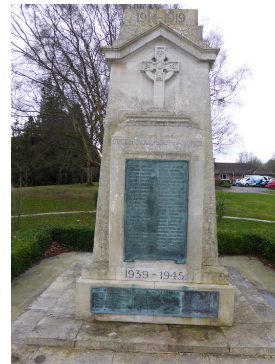
War Memorial 1949 with metal plaques added