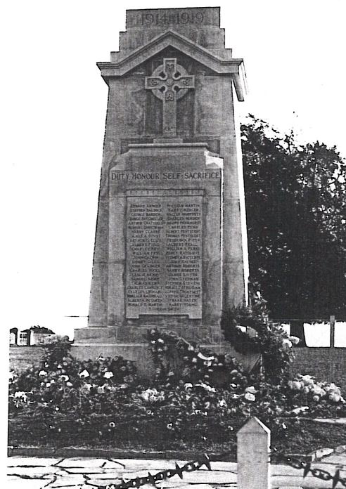
War Memorial unveiled 1921 with stone plaque